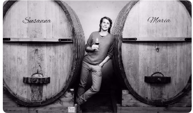
Natte Valleij is an historic estate on the slopes of the Simonsberg mountains, recently revitalized.