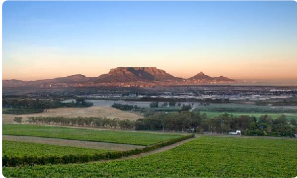
De Grendel is the closest wine estate to Cape Town city center, and originally served as the gateway to interior of the country.