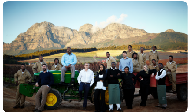
Noble Hill makes terroir-specific wines from the granitic slopes of the Simonsberg mountains.