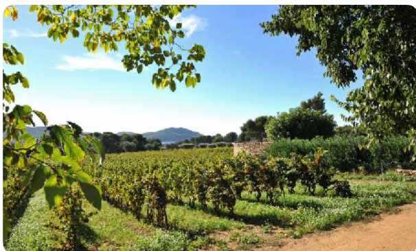
Domaine Maubernard is a tiny Bandol producer on the shores of the Mediterranean whose wines espouse a genuine joie de vivre.